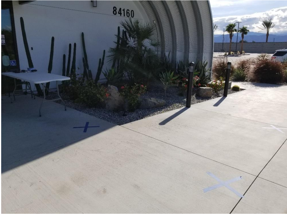
“Blank Wall Façade” is missing required additional glazing