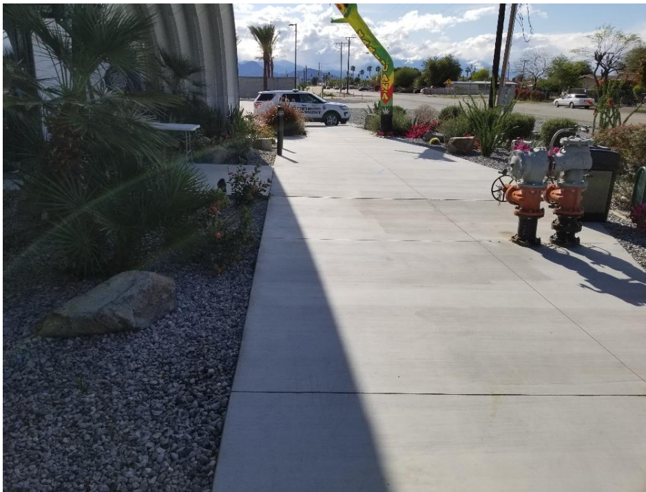
Front Entry is missing “Bicycle Racks”