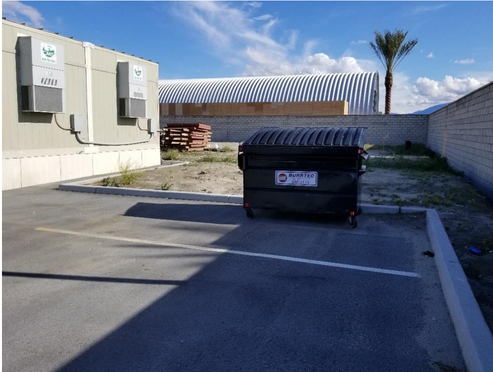
“No Trash Enclosure” - Trash bin is stored in the open parking area.

As noted above, numerous Conditions of Approval of CUP 312 are being violated. Due to this noncompliance, as authorized by Section 17.84.070(D) and Section 17.74.050(B)(1) of the Coachella Municipal Code, revocation of CUP 312 is determined the appropriate City response.