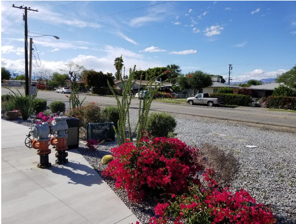
Landscaping along Avenue 48 is missing the required "Perimeter Fencing"

Staff conducted a site visit of The Lighthouse property and the adjoining parking area to the west on April 8, 2020. Staff observed the lack of compliance with several of the conditions of approval as noted above. Shown below are some of these photographs with a description of the violation of the condition of approval.